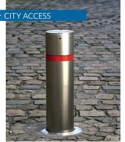
Bollard, perimeter access, traffic management