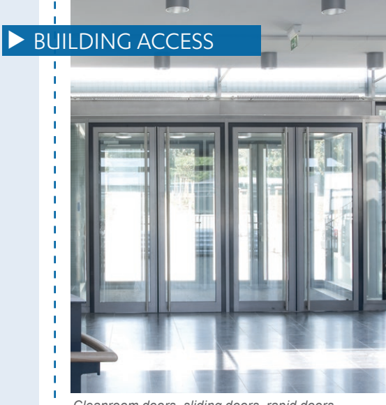
Cleanroom doors, sliding doors, rapid doors, revolving doors, lifts