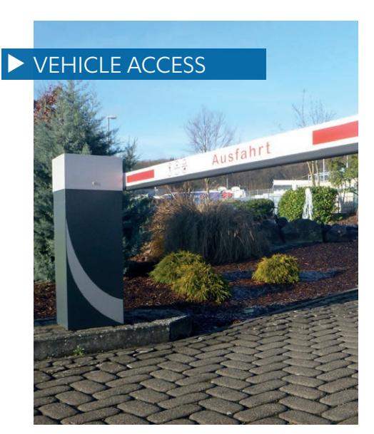
Parking and highway barriers, automated fences