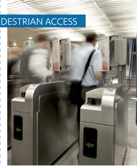
ubway, railway & airport swing gates, turnstiles

We are constantly recognizing these needs and converting them into new product innovations to be used in many applications.